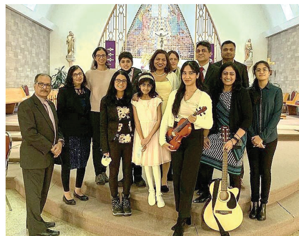
File photo of the choir at the St Francis Xavier Feast Mass celebrated by the Quebec Goan Association (QGA) on December 4, 2021.