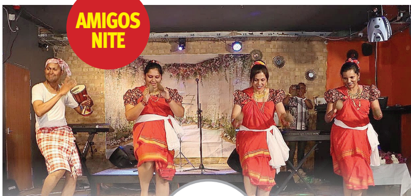
A Goan folk dance being performed at Amigos Nite in Hounslow, London on August 20.

The event management company Amigos Nite organised World Goa Day at the London Bar Stock Exchange, Hounslow Market Place, London, on August 20. The event from 5 pm till 11 pm had a full house in attendance, with a variety of Goan artistes, music, dances and traditional cuisine.