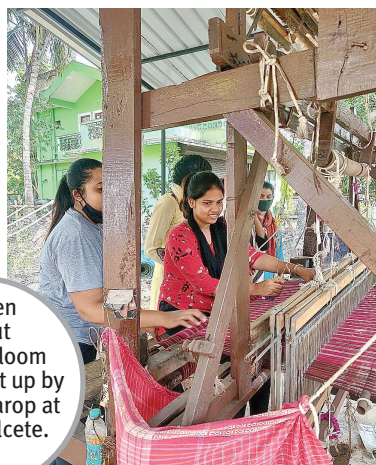
Women try out the handloom recently set up by Goa Sudharop at Orlim-Salcete.

and men and give ethnic Goans an economic opportunity. Many students from schools, colleges and other Kunbi fabric lovers visit the loom.